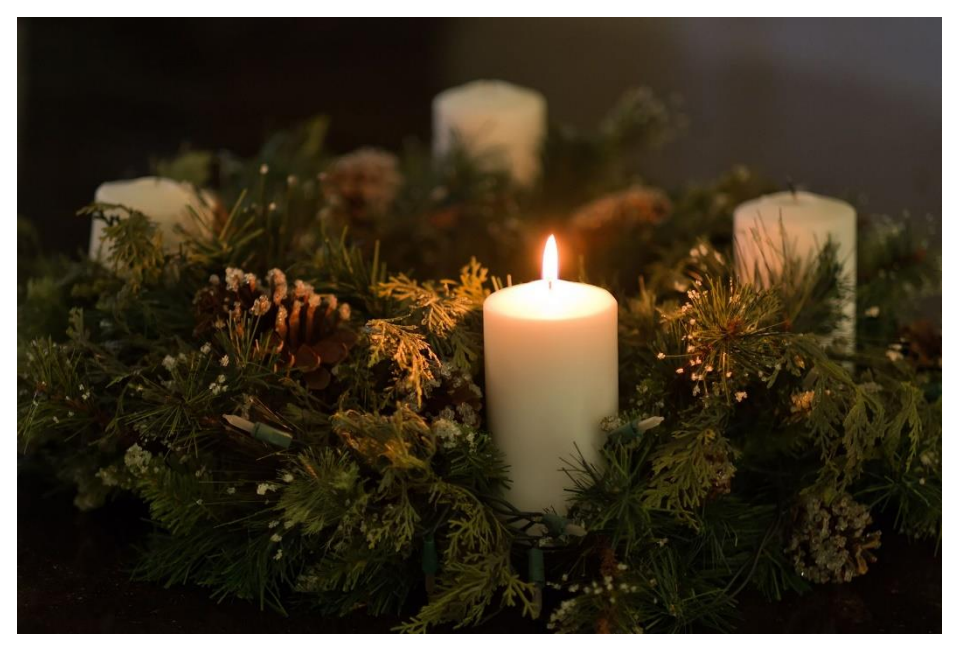
The King is coming

Please use 'T' on your hearing aid if you need to use the Hearing Loop.